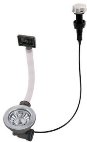
Automatic waste fitting 8407 100